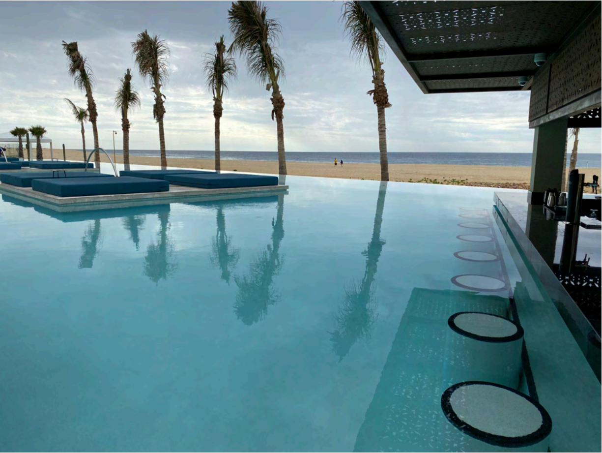
Adults only pool